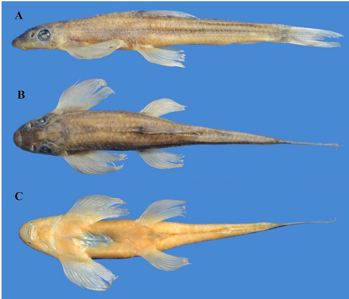
Figure 1. Psilorhynchus bichomensis , ZSI FF 5908, holotype, 43.0 mm SL; India: Arunachal Pradesh: East Kameng District, Bichom River. A, lateral view; B, dorsal view; C, ventral view of body.