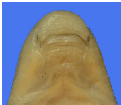
Figure 2. Oromandibular structures of Psilorhynchus bichomensis , ZSI FF 5908, holotype, 43.0 mm SL.

inclination from anal-fin origin posteriorly towards caudal fin.