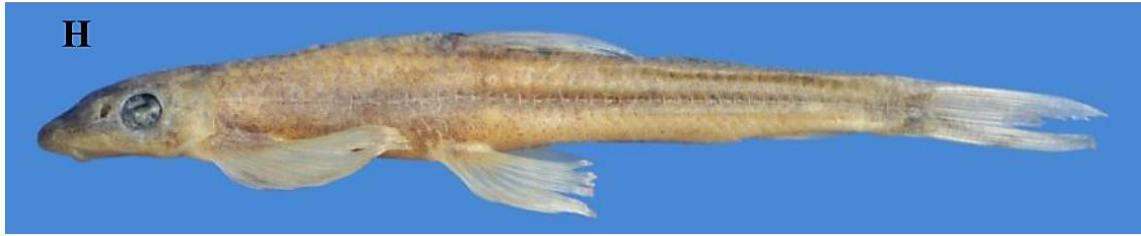
Figure 6. Lateral views of Psilorhynchus homaloptera species group. (A) P. arunachalensis ZSI FF 7000, 89.66 mm SL, (B) P. pseudecheneis ZSI F1229/2, paratype, 83.0 mm SL, (C) P. homaloptera ZSI F 11792/1, holotype, 54.4 mm SL, (D) P. khopai ZSI FF 5412, paratype, 8.18 mm SL, (E) P. microphthalmus ZSI FF 5489, paratype, 52.06 mm SL, (F) P. konemi MUMF 12142, holotype, 59.4 mm SL, (G) P. rowleyi ZSI F 13461, lectotype, 75.5 mm SL and (H) P. bichomensis ZSI FF 5908, holotype, 43.0 mm SL.

The mouth part of all members in the P. homaloptera species group (Fig. 5) possesses a reduced skin flap located at the postero-lateral corner of mouth compared to other congeners (Conway and Kottelat 2007; Conway et al. 2012). Unlike the other members of the group, P. bichomensis shows feebly developed papillae-like lobe at the corner of the mouth with the upper and lower jaws fully exposed. All members of the P. hamoloptera species group (Fig. 6) except P. konemi exhibits distinct spots in the mid-dorsal region between occiput and dorsal-fin origin and 2–6 dark brown round to squarish markings on the lateral sides of the body along the lateral-line scales. Psilorhynchus bichomensis has plain body without any markings. The new species shares similar character with P. konemi in having plain body without bars, saddles, spots or markings. However, P. bichomensis is different from P. konemi in having a more slender body with uniform pale yellowish colorations vs. slightly arched body with olive brown.