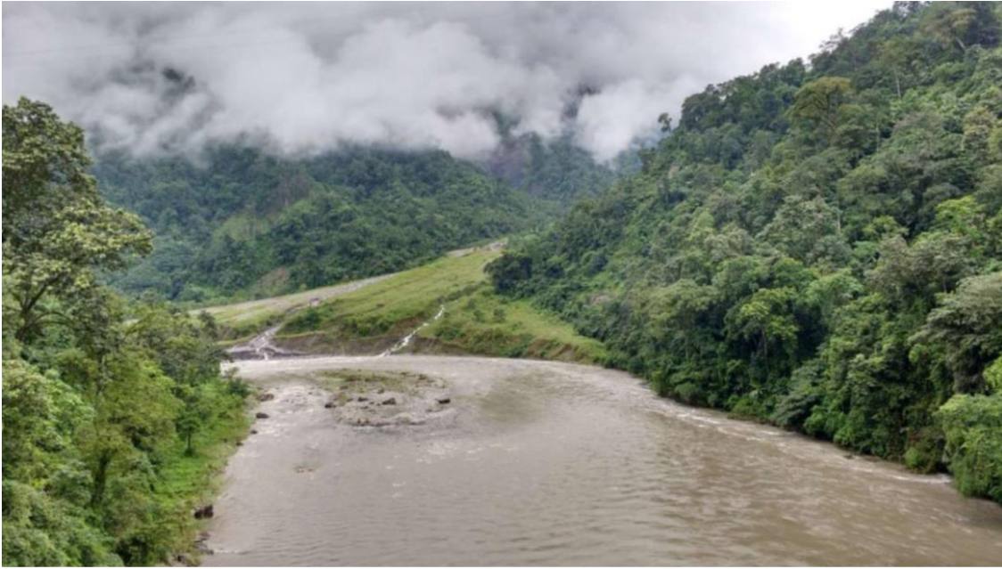
Figure 3. Bichom River, type locality of Psilorhynchus bichomensis .

of isthmus, connected with rostral cap by a papillae-like skin fold around corner, expanded to form a small lobe at postero-lateralmost corner of mouth. Gill rakers absent.